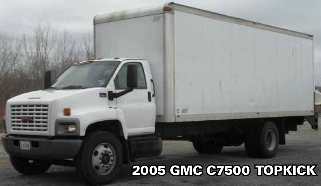
2005 GMC C7500 TOPKICK