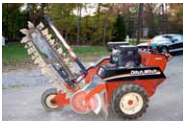
2007 DITCH WITCH 1820