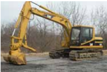
1995 CAT 312