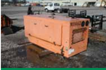
1989 SULLIVAN D125U4 AIR COMPRESSOR