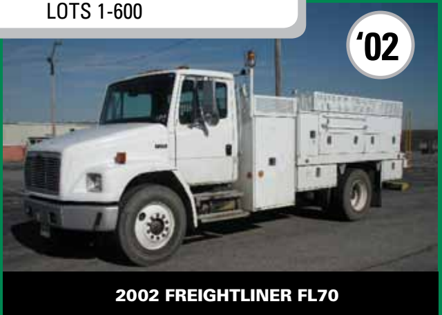
2002 FREIGHTLINER FL70

DAY 2 – Internet Only Auction – Tools, Support Equipment, Attachments & More – Bidding Closes March 15, 2010, beginning at 2 PM – Lots 1000 & Up