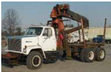
1980 CHEVROLET BRUIN GRAPPLE