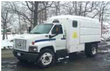
2004 CHEVROLET C6500 12' CHIP BODY