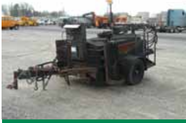
1993 CHAUSSE TP325 ASPHALT KETTLE