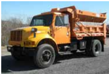
1995 IHC 4700 S/A