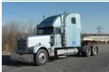
2002 FREIGHTLINER CLASSIC XL T/A