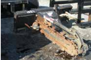
BOBCAT TRENCHER ATTACHMENT