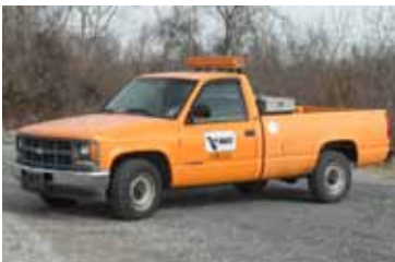
1994 CHEVROLET 2500