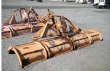
2 OF 13 SNOW PLOWS