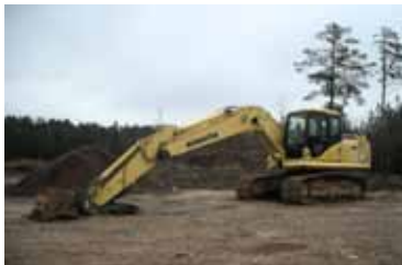
2004 KOMATSU PC160LC