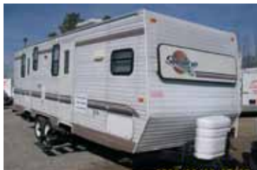
2002 SOLARIS SUNLINE 280SR

Mount PTO; Locking Differential; 50080# GVWR; AB; CAT 3208 8-Cyl. Dsl. Eng.; Allison AT.