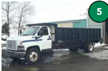
2005 IHC 4300