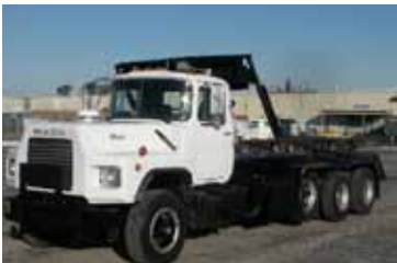
1996 MACK DM690S TRI-AXLE 18'