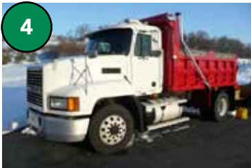
1999 MACK CH612 S/A