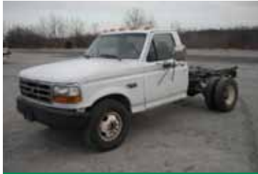
1993 FORD F350