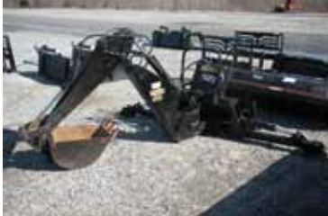
BRADCO 802 BACKHOE ATTACHMENT

WiFi Onsite – Bring your laptop on March 12 th if you'd like to bid while you're here!