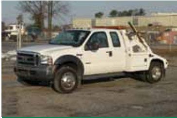
2006 FORD F450 XLT