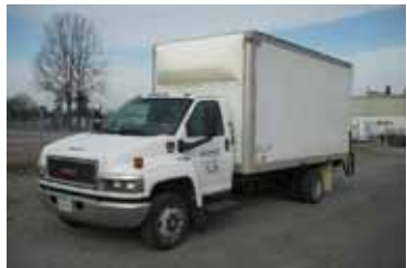
1 OF 14 BOX TRUCKS