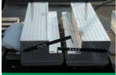
DIAMOND PLAT SIDE TOOL BOXES